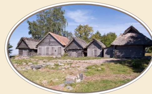
Famous fishing net sheds in the seaside village Altja