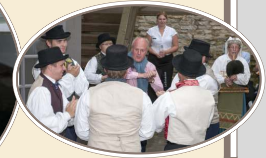
Rustic Estonia BBQ party with folkloric music