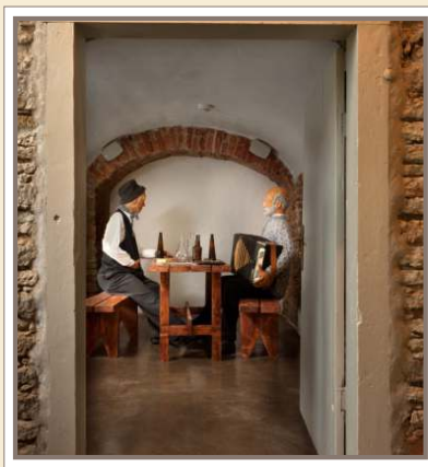
Vodka Museum in Vihula Manor

In the evening we enjoy a rustic Estonian midsummer party at the folkloric Kaval-Ants Tavern in the old Ice-Cellar of the estate.