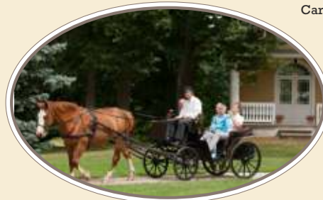
Horse carriage ride