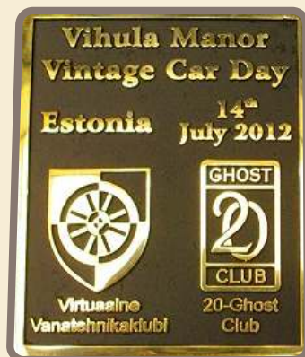
Rally plaque for participants