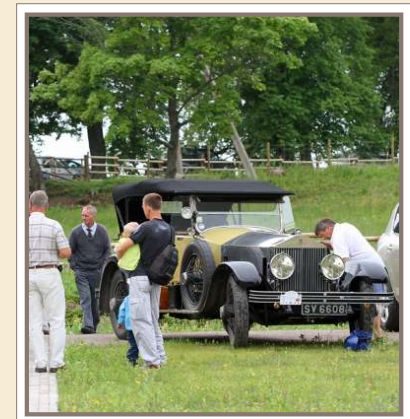
Visitors can talk to proud owners about their treasured vehicles