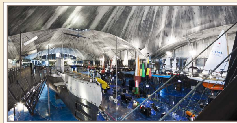
Museum inside the seaplane hangars.