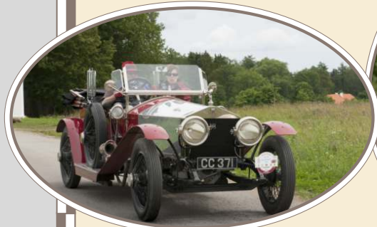
Mini national park tour